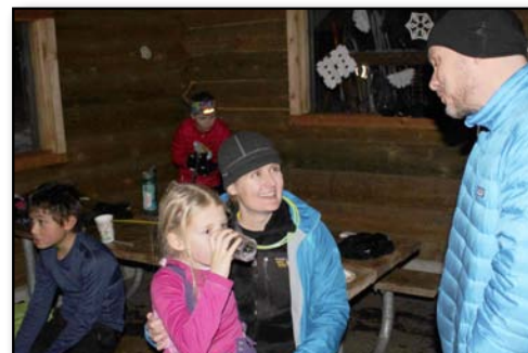
About 30 adults plus kids brought in the new year in at the Nova Hut.

An impromptu gathering showed the spirit that makes Nordic skiing special.